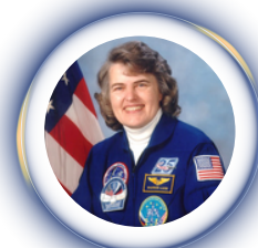
Dr. Shannon Lucid Spaceflight trailblazer & biochemist astronaut