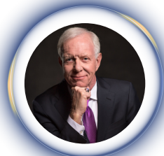
Captain C. B. "Sully" Sullenberger Hero pilot & aviation safety leader