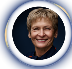
Dr. Peggy A. Whitson Record-setting astronaut & spaceflight leader