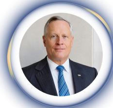
Captain Ross Perot Jr. Record-setting aviator & aerospace innovator