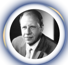
(The Late) Leonard Greene Inventor & aviation safety innovator